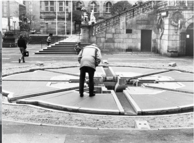
The “Sunken Fountain” counter monument, where a fountain was rebuilt inverted into the ground to mark the holocaust (Young)

The “Sunken Fountain” particularly struck me as significant in how it had physically inverted the fountain that used to exist, playing into the ways in which absences can help us remember dark or unpleasant heritage in conflict and stories of loss. Inspired by this, I wanted to make a design where viewers could similarly see a subversion of the plaques common in College Hill. I aimed to contribute to this sense of subversion through, first, inverting the colors used in most of the plaques, using a stark black background with white accents rather than a white background to signify the focus on destruction versus construction, and the message on racial discrimination. Furthermore, the position of these plaques, interspersed among everyday life and spaces such as in the memorial to Sammy Devenny, would also mark a sense of aberration and dissonance