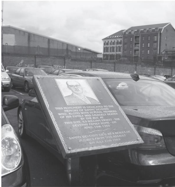
A memorial to Sammy Devenny in Northern Ireland, marking the first death of the troubles, located where he was killed (McDowell and Switzer)

The concept is inspired by the idea of counter-monuments that act as alternative forms of commemoration that differ from traditional norms. Some examples which inspired my work are included below: